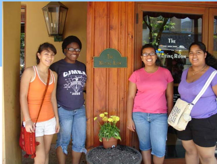
The Rahway Water Champions conduct a water audit at the Waiting Room Restaurant in the City of Rahway, N.J.

The Water Champions Program has the potential to place high school students at the center of a stakeholder-driven learning community. Through this learning community, we hope to increase knowledge, skills, and develop new public attitudes that will foster better management and conservation of water resources. Participants of the Water Champions Program will be acting as good stewards by developing a promotional campaign on water conservation within their local community. This campaign will help the public make smarter purchasing decisions and ultimately reduce water usage throughout the community.